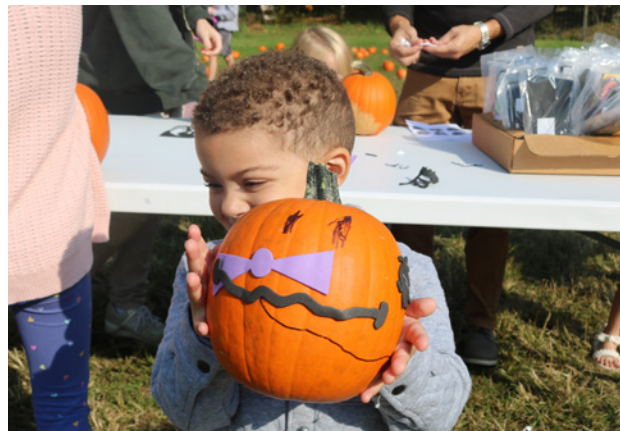
2024 Fall Festival

together to sing, dance, play, and explore as we learned about how we can trust God. Lumen the Lightning Bug led the party, sharing the message of God’s abundant love with everyone at Camp Firelight. We were privileged to once again invite families to a celebration luncheon after Barefoot School. Many thanks to the wonderful and talented people who take part in planning, preparing, and executing this week of fun for the children in our community.