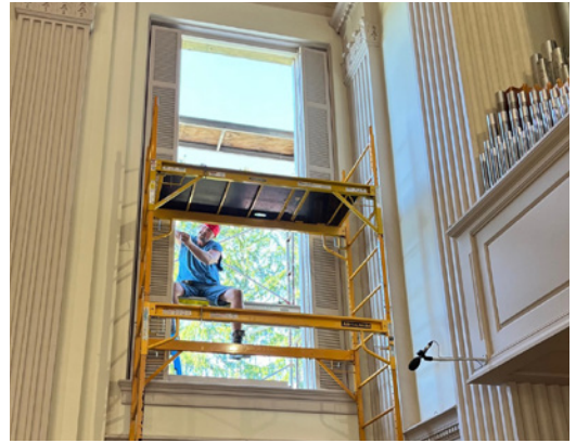
One of the two chancel windows being replaced.

$150,000 grant from Endowment for the project and the Let There Be Light Project fundraising raised $346,963.78. This brings our total funding for the project to $491,963.78. We also anticipate that the project will be delivered under budget, but at this time we are not able to quantify what that might be.