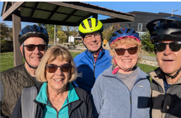
Church Bike Ride