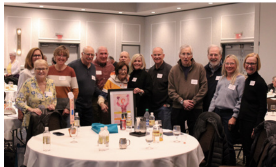
Westminster receives a gift of appreciation at the Parkinson’s Foundation, Living Well Conference.