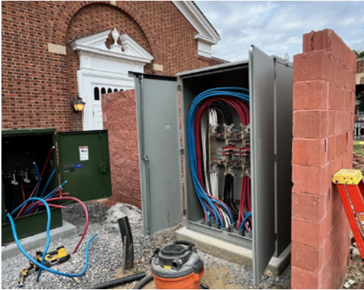
The new electrical box and transformer located on the north side of the Galbreath Chapel.

This year has been a very busy year for the Property Commission and the church staff in maintaining the grounds and building. We completed 21 of 22 projects of various types and complexities throughout 2024. For the largest project (and the only project that will not be completed in 2024), we started the planning and engineering processes in 2023 for the electrical service replacement project that is also known as the Let There Be Light! Project. This year we finalized the engineering plans, put together the scope of work and project bidding documents,