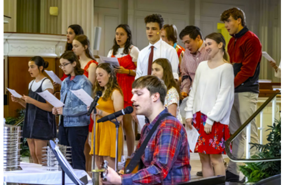
Veritas leading in worship

(July) Four days in a row we gathered together to have FUN. This is the most highly anticipated event of the year. We visited an escape room, Puttshack, and Keystone Safari. We also learned more about StreetMOMs, met some teens whose parents are impacted by addiction and homelessness, and created more QuickIts.