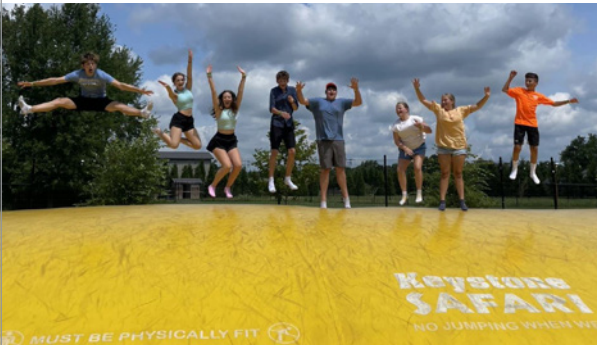
Having fun at Keystone Safari