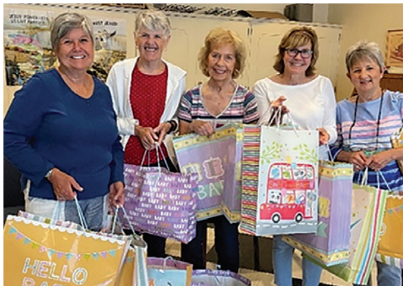
Baby Bundles providers