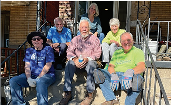
Rebuilding Together Pittsburgh home rehab team