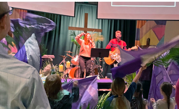
The Bridge Worship service on Palm Sunday