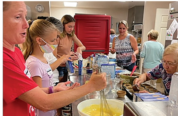
Meals on Wheels Cupcake Baking