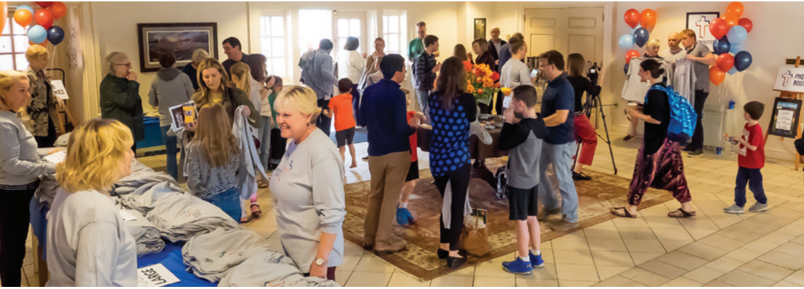
Westminster's Brand Celebration on March 6, 2022