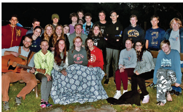
Annual evening at Gilfillan Farm