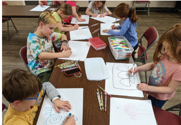
Kids’ Connections students create Last Supper art

Kids’ Connection began as a place for elementary schoolers to connect with God and each other during Lent. For five Wednesdays, children from PreK through 4th grade gathered to learn about the stories of Holy Week, build community, and play together. After such a positive response, we decided to make Kids’ Connection a permanent Wednesdays offering beginning in the fall. There are now two Kids’ Connection classes that gather on Wednesday evenings: PreK-2nd grade and 3rd & 4th grade. Led by