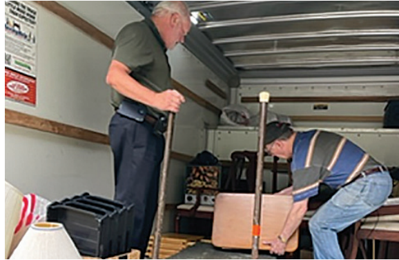
PRISM Garage Giveaway transport