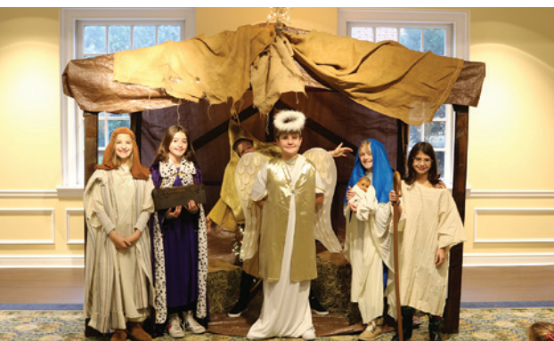
Breakfast at the Manger

Sunday School has seen steady growth in the start of the 2022-2023 program year. Both services offer one class for PreK through 4th grade with devoted Sunday School teachers and eager middle and high school assistants. At 9:45 worship, we have been blessed with an abundance of new children and families participating in worship and Sunday School.