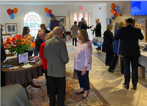
Everyone enjoying the Westminster Brand Celebration