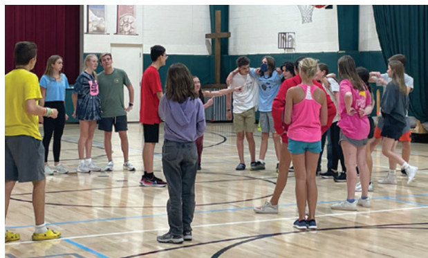
Playing a game in the WROC

With new opportunities for mission, service, and study, this growth will continue to draw the Veritas family ever-closer to Jesus. Through multiple years of uncertainty and