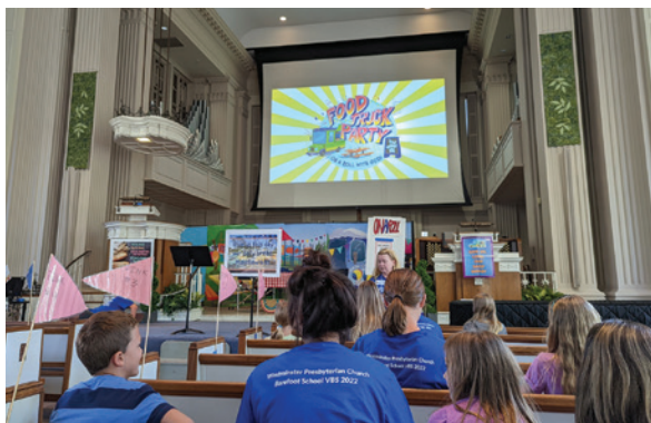
Food Truck Party Barefoot School VBS

The 5th and 6th graders of JAM (Jesus and Me) were glad to resume regular in-person meetings and adapted well as we moved between the JAM room and Fellowship Hall depending on COVID risk levels. In February, they hosted a valentine making event, creating valentines to send out to members of the congregation. On Ash Wednesday, the students participated in the prayer stations and worship. It was a moving and meaningful evening for many who had never experienced the imposition of ashes. After summer break, JAM kicked off its year with a pool party to celebrate the end of summer. The group continues to grow as students bring friends for both special events like the annual Bair Giving Tree shopping trip and regular Wednesday meetings.