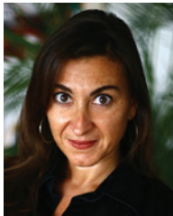
Lynsey Addario November 7, 2023