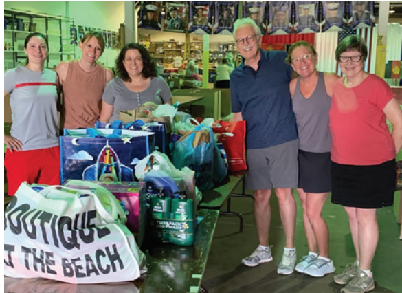
The Deacons and volunteers collect personal care items for Operation Troop Appreciation

Deacons – The Deacons provide a variety of support to the members of the church. They facilitate the Care Calendar in providing meals as needed, serve home communion, deliver flowers, coordinate the blood drives, and organize special collections. Care calls were made by deacons to members of the church to stay connected and to identify any needs.