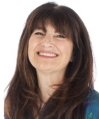
Ruth Reichl December 5, 2023