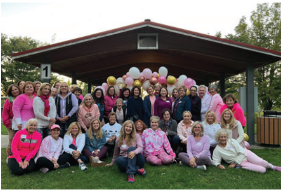
The Zumba class celebrates its 15-year anniversary at Peterswood Park

Participants were welcomed back without restrictions, new overhead LED lights, and an improved sound system. Fresh promotional materials included a Parkinson's Fitness brochure and a general WROC program brochure along with a refurbished website. The Parkinson's Fitness Program brochure was distributed to physicians throughout the Pittsburgh area. The reputation of Westminster as a strong ministry for those diagnosed with Parkinson's disease is building in the treatment community. We now offer four Level 1 classes and two Level 2 classes with plans to increase class offerings in 2023. Additional heavy bags,