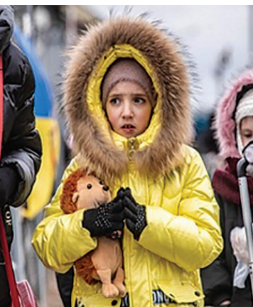
Ukrainians in need of assistance through PDA

• Presbyterian Disaster Assistance (PDA) - Early each year Outreach commission decides how much to allocate for the work of our mission partners. A percentage remains undesignated so Westminster can respond to emergencies as they unfold. In early March, at the beginning of the