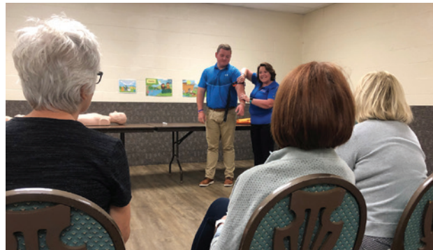
Usher’s health and safety training class

We offered health and safety training for our ushers. Tri-community south EMS taught CPR.