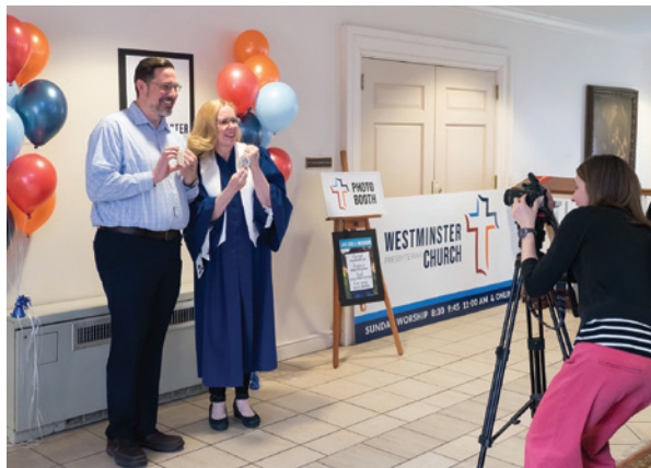
The Westminster Brand Celebration photo booth