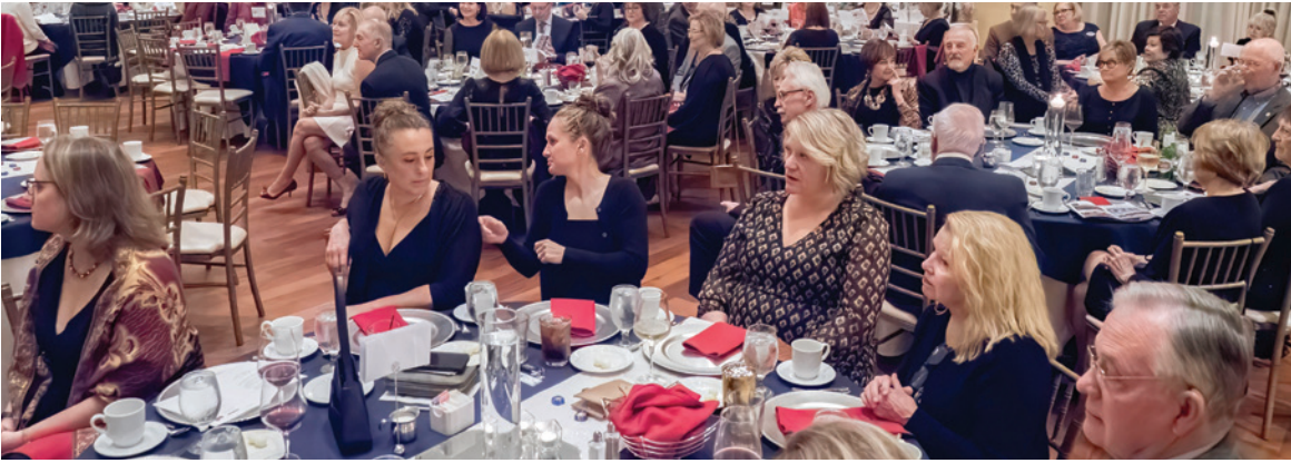
2022 Giving Gala