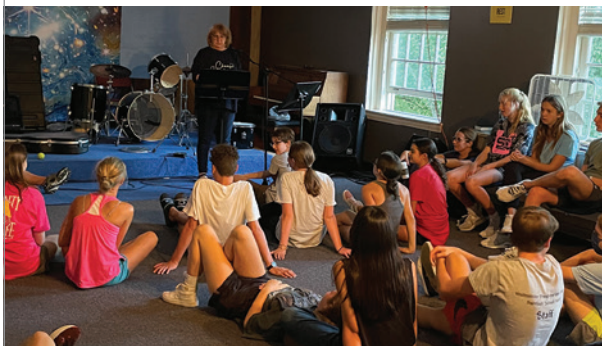
Hearing a scripture lesson

and high school students travelled to Elkview, WV for a home repair trip. Not only did these teenagers paint, build, and connect with the residents of their worksite, they were also challenged to consider what it might look like to “Go Serve” in all aspects of their life and faith.