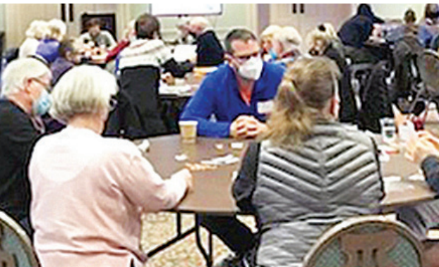
Racial Wealth Gap Simulation