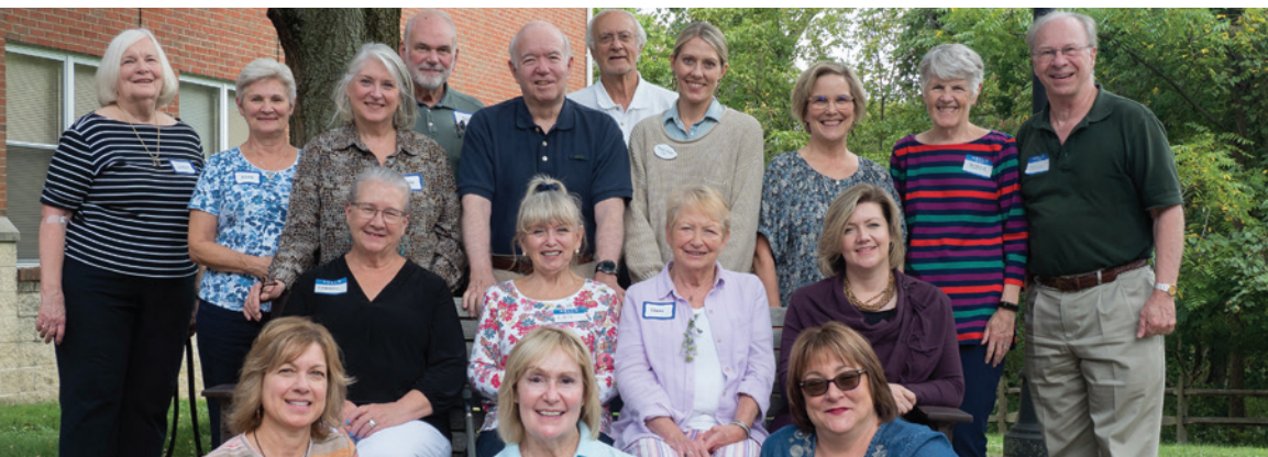
Day Away Retreat