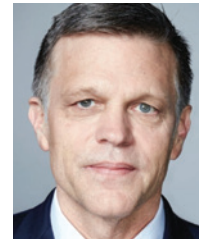
Douglas Brinkley April 9, 2024