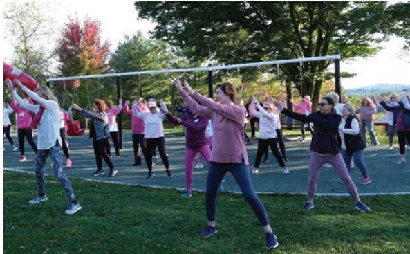
The Zumba class exercises outdoors at Peterswood Park

reflex bags, speed bags, and mats were purchased to accommodate the increase in class numbers.