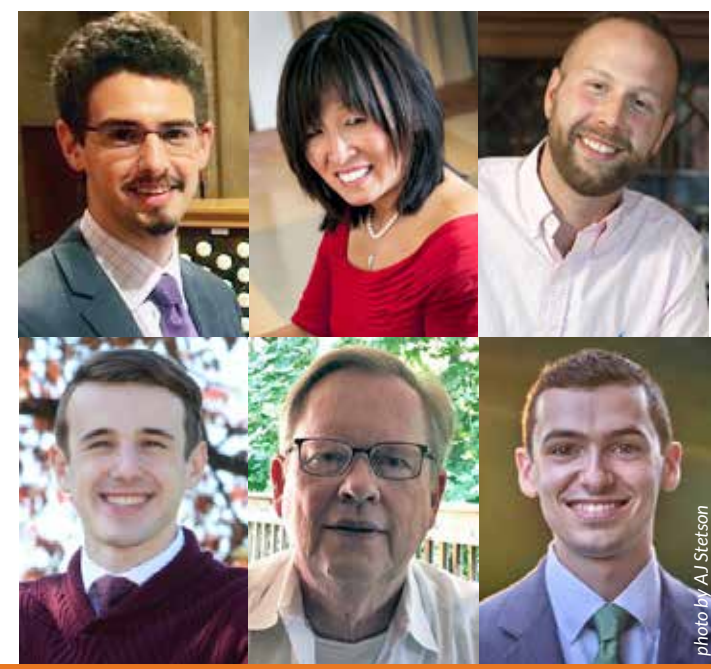
THURSDAYS JUNE 16 — JULY 21 @ 5:00 P.M