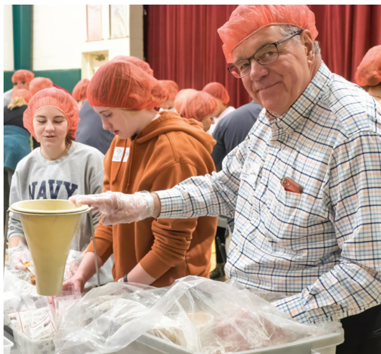
Rise Against Hunger volunteers help with making of food packets

runs the Welcome Center and plans and hosts various church social/food events throughout the year to provide an atmosphere where our congregation can meet and socialize with one another. Examples are Super Sunday, lunches after worship, a Veterans’ lunch, ice cream socials, etc. We are responsible for Food & Fellowship, the Wednesday evening dinners. We also created Forks & Fellowship, a ministry where people come together in each other’s homes. Bike rides are organized periodically.