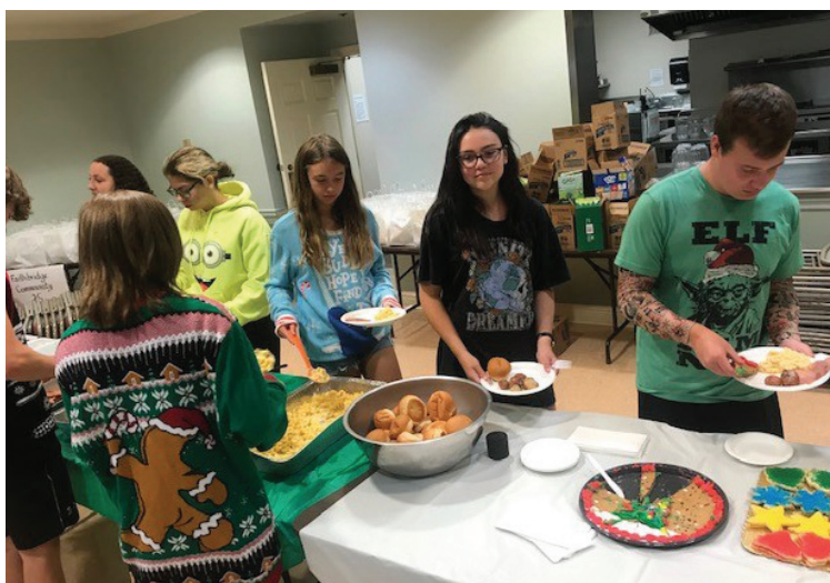
Wednesday’s Food and Fellowship

The commission focuses on engaging our congregation—our community of faith—in the life and work of this church, beginning when people first come into our building. It