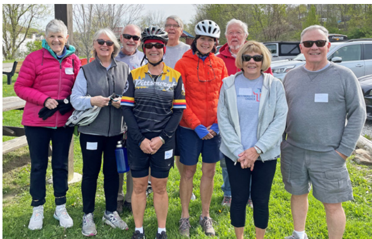
A Saturday morning bike ride

This commission is also responsible for membership. We organize an Inquirers' Gathering two times a year, inviting our visitors to learn more about what it means to be a member in the Presbyterian Church. We work to assimilate new members once they join. We are also responsible for making sure that our membership is accurate and that we are removing names from membership when people move away or choose not to be an active part of the congregation. We want our roles to accurately reflect the members who actively participate in the life of this church. We continue to love and care for our senior citizens when active participation is no longer possible.