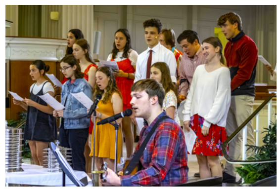
Veritas leading in worship

SHIM Food Drive (November) Students ventured into neighborhoods to collect food