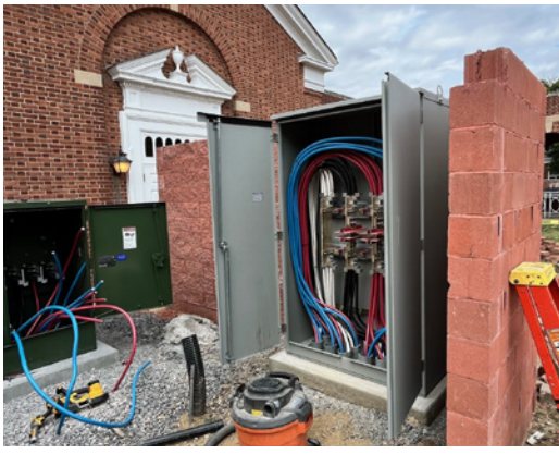
The new electrical box and transformer located on the north side of the Galbreath Chapel.

This year has been a very busy year for the Property Commission and the church staff in maintaining the grounds and building. We completed 21 of 22 projects of various types and complexities throughout 2024. For the largest project (and the only project that will not be completed in 2024), we started the planning and engineering processes in 2023 for the electrical service replacement project that is also known as the Let There Be Light! Project. This year we finalized the engineering plans, put together the scope of work and project bidding documents,