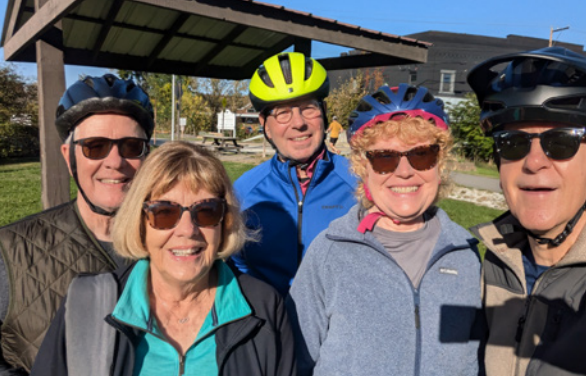
Church Bike Ride