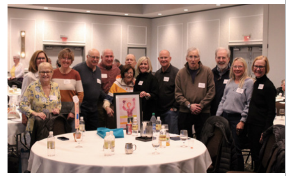
Westminster receives a gift of appreciation at the Parkinson's Foundation, Living Well Conference.