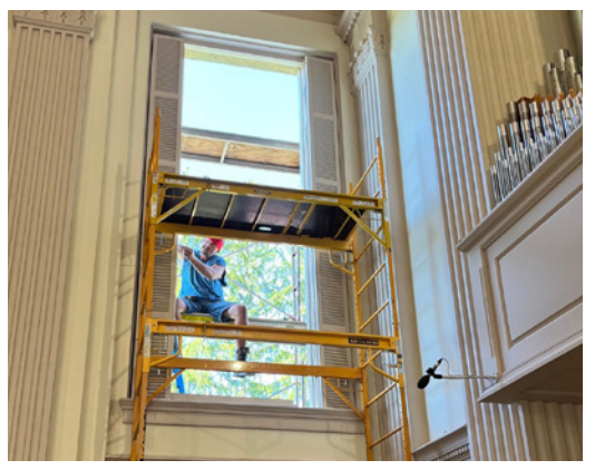
One of the two chancel windows beinging replaced.

$150,000 grant from Endowment for the project and the Let There Be Light Project fundraising raised $346,963.78. This brings our total funding for the project to $491,963.78. We also anticipate that the project will be delivered under budget, but at this time we are not able to quantify what that might be.