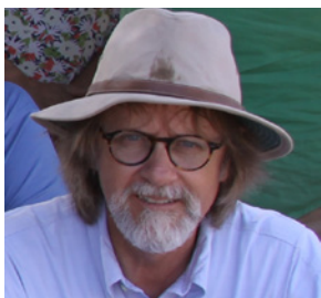
Ron Tappy, Professor Emeritus of Bible and Archaeology Pittsburgh Theological Seminary

This offering supports programs including the Summer Series and the letter writing campaign for hunger relief for food insecure families. It also enables the church to promote the Peace of Christ by addressing systems of injustice locally and globally. Please give using the designated pew envelopes or go to Give Online on the church homepage and select this offering on the dropdown menu.